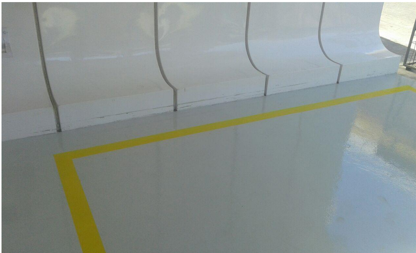
Final look of flooring at Shell Retail Station Lube Oil change bays, Karachi

In addition to this, Sikafloor-161 primer was recommended for priming concrete substrates, cement screeds and epoxy mortars. Sikafloor-161 is a low viscosity epoxy resin which forms an Intermediate layer underneath Sikafloor-263 SL to give the flooring smooth & seamless look. Lastly, Sika Marker was recommended to mark the lube oil change area. Sika Marker is an aerial curing paint for car park and road lining & signing.